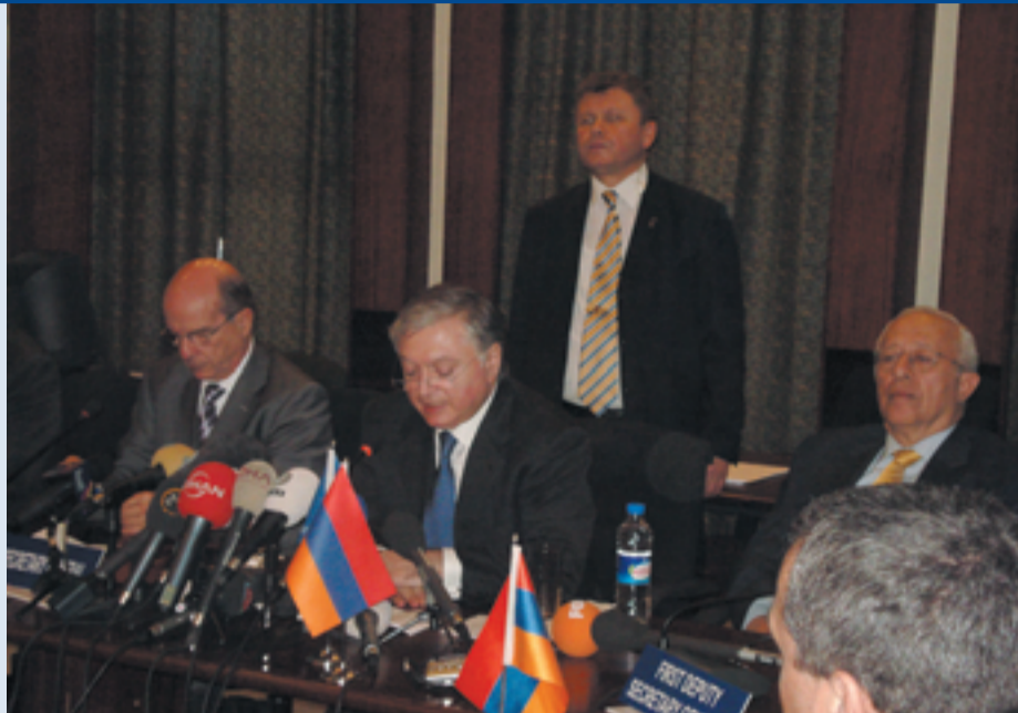
H.E. Edward NALBANDIAN, Chairman-in-Office of BSEC and Minister of Foreign Affairs of the Republic of Armenia, announcing the priorities of the Armenian Chairmanship at the BSEC Headquarters in Istanbul.

As is known, the Republic of Armenia has assumed the Chairmanship-in-Office of BSEC as of 1 November for a period of six months ending on 30 April 2009. During this period, the Armenian Chairmanship envisages to implement a comprehensive calendar of events which is expected to enhance BSEC cooperation in a number of areas. Among the high level events, in addition to the Meeting of the Council of Ministers of Foreign Affairs, the Armenian Chairmanship will host Meetings of the Ministers of Energy, Transport, Agriculture and Environmental Protection.