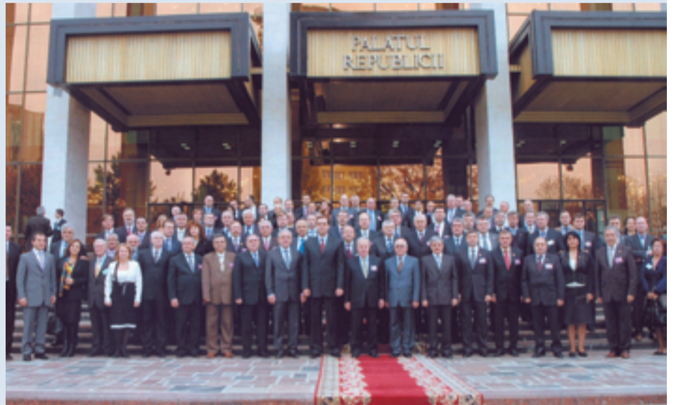
Family photo at the Thirty-second Plenary Session of PABSEC General Assembly held in Chisinau on 3-5 November 2008.

The participants also reviewed the results of the 19th Meeting of the BSEC Council of Ministers of Foreign Affairs held in Tirana on 23 October. The members considered the Progress Report of the Parliamentary Assembly.