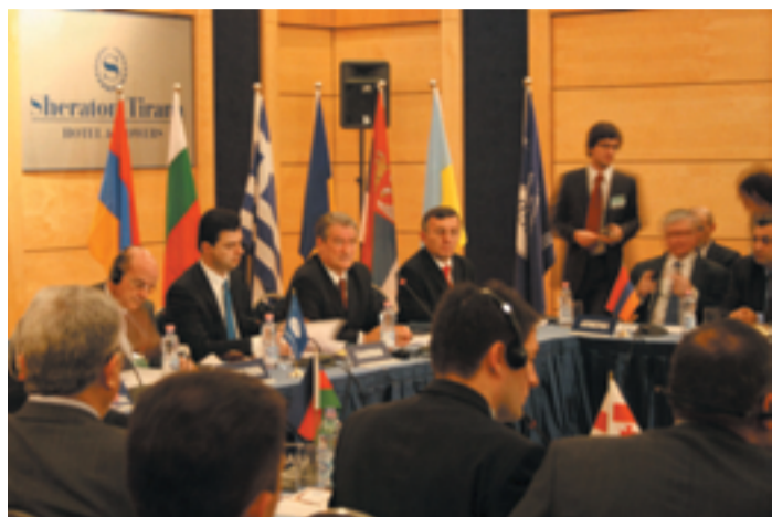
H.E. Sali BERISHA, Prime Minister of the Republic of Albania, addressing the 19th Meeting of the BSEC Council of Ministers of Foreign Affairs in Tirana.

The 19th Meeting of the BSEC Council of Ministers of Foreign Affairs was held in Tirana on 23 October. The meeting was hosted by the Republic of Albania. Prime Minister H.E. Sali BERISHA made an opening address, while H.E. Lulzim BASHA, the Minister of Foreign Affairs of the Republic of Albania, chaired the meeting in his capacity as the Chairman-in-Office of the Organization.