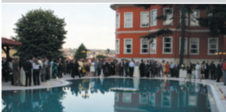
BSEC Day reception: celebrating the 16 th anniversary of the establishment of BSEC.