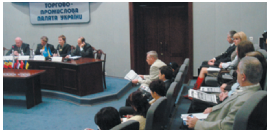
Black Sea Partnership Forum for Cereals and Cereal-based Products in Kiev on 12-13 November.

The work on these documents will continue at the next meeting of the Ad hoc Group scheduled for January 2009. In the meantime, the Ad hoc Group is also expected to focus on the elaboration of a concrete Black Sea Sectoral Partnership.