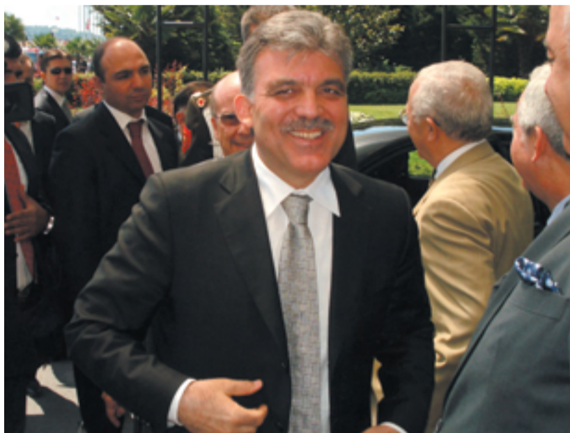
Turkish President H.E. Abdullah GÜL visiting the BSEC Headquarters on the occasion of BSEC Day.

The 16th year anniversary of the establishment of BSEC was also commemorated by the other BSEC Member States with different activities.