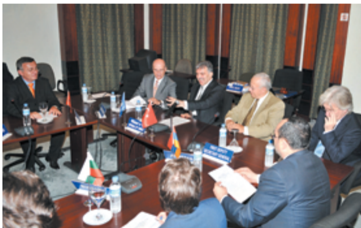
Turkish President H.E. Abdullah GÜL addressing the representatives of the BSEC Member States and Observers at the Organization's Headquarters on BSEC Day.