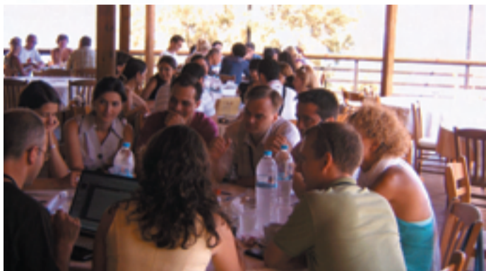
Working Groups during the First International Symposium on "The Wider Black Sea Area in Perspective", Kalymnos, July 2008.