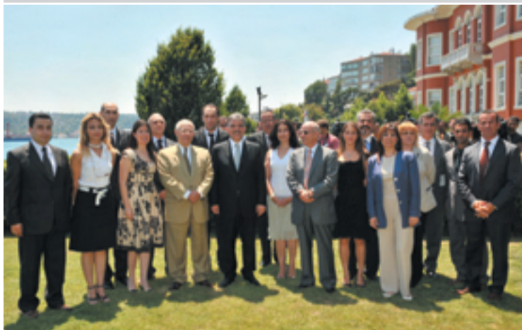
Turkish President H.E. Abdullah GÜL with the members of the BSEC Permanent International Secretariat on BSEC Day.